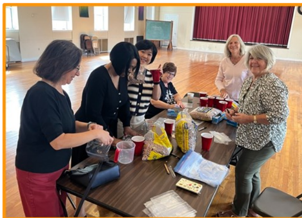
CUMC Outreach Ministry in action