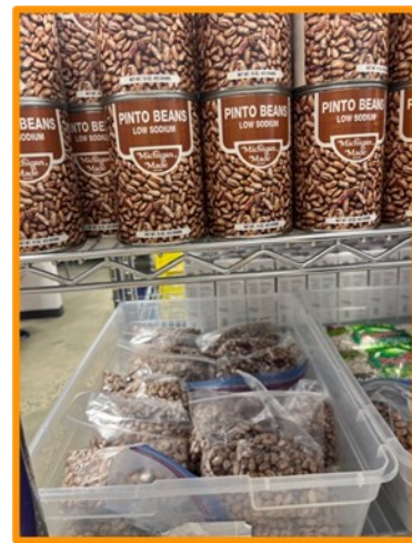
Bags of beans ready for clients