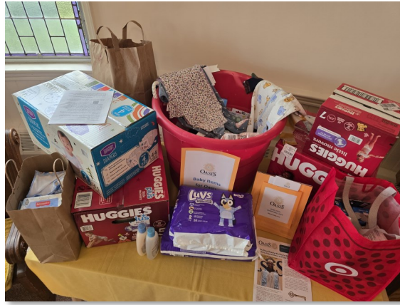
Oasis Baby Items