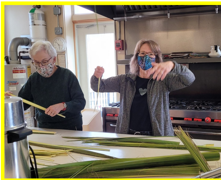
Palm Sunday and Easter Preparations