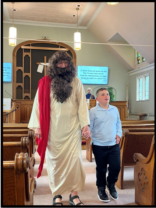
A Young Disciple Walks With “Jesus”