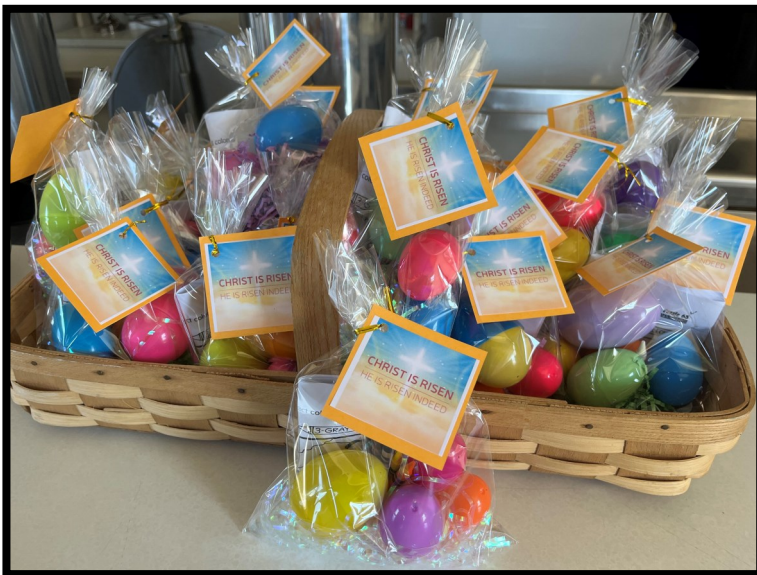
Easter Gift Bags