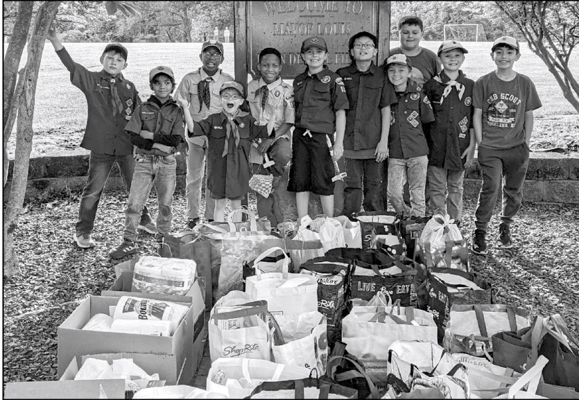
(above) Cub Scouts Pack 801 with their 2024 collection.