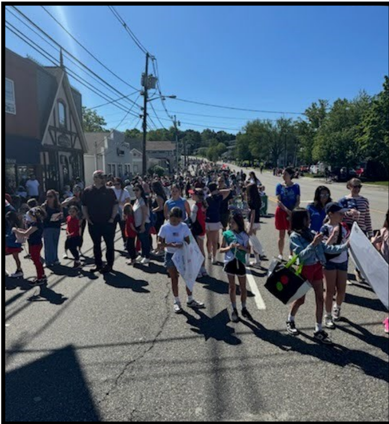
Marching in the Memorial Day Parade