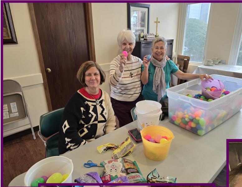
Preparing for the Easter Egg Hunt