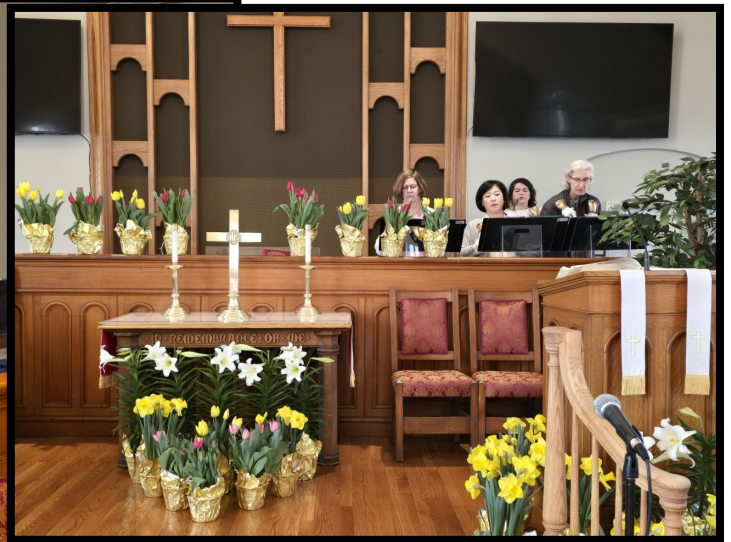
Handbell Choir –Good Friday